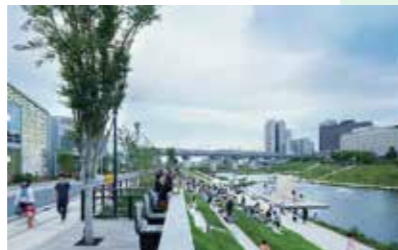
Kashiwa-no-ha Aqua Terrace