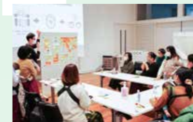
Minnano Machizukuri Studio

Since 2006, Kashiwa-no-ha Campus area has been promoting urban development through public, private and academia collaboration centered on Urban Design Center Kashiwanoha (UDCK). Making use of this collaborative platform, opportunities are available where you can examine and test your business in an actual social setting, such as "Innovation field Kashiwa-no-ha" which provides an entire town as a test field for startups and other private sectors to assess their products and services, and "Minnano Machizukuri Studio ("urban development studio for all")" where new products, services, and projects are created from the perspective of consumers.