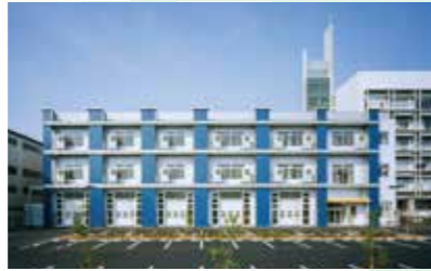
Todai-Kashiwa Venture Plaza