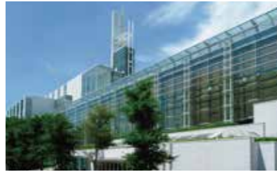
Tokatsu Techno Plaza

Kashiwa-no-ha campus area is home to some of Japan's leading technologies and researches such as the University of Tokyo, Chiba University, and National Cancer Center Hospital East. 'Tokatsu Techno Plaza' and 'Todai Kashiwa Venture Plaza', the two public incubators, and 'KOIL', a large co-working space, makes it an excellent environment for startups where they can develop their businesses. With only a 30-minute train ride from central Tokyo while capable of providing a living environment full of nature, Kashiwa City can simultaneously nurture both business growth and team building for startups.